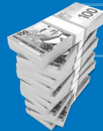
WHAT YOU OWE

WALKAWAY pays the difference between your vehicle's value and what you owe.